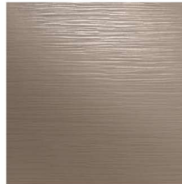
AMPATO Steel Structural SR 1200x1200 mm AMPATO Stahl Strukturiert SR 1200x1200 mm