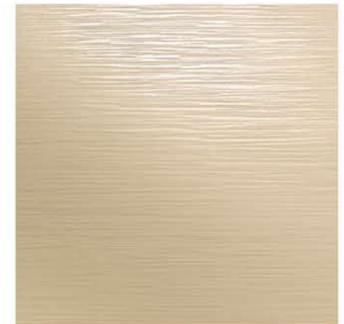
AMPATO Oliva Structural SR 1200x1200 mm AMPATO Olive Strukturiert SR 1200x1200 mm