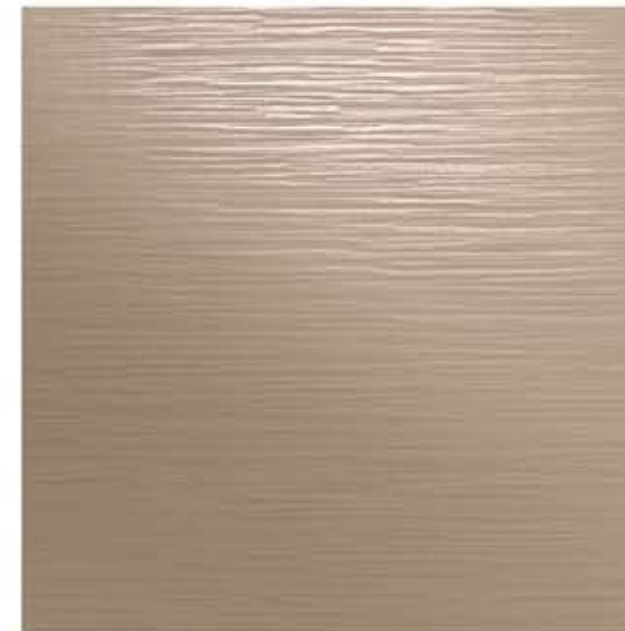
AMPATO Coffee Structural SR 1200x1200 mm AMPATO Kaffee Strukturiert SR 1200x1200 mm