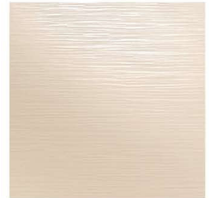
AMPATO Beige Structural SR 1200x1200 mm AMPATO Beige Strukturiert SR 1200x1200 mm