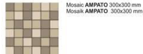
Mosaic AMPATO 300x300 mm Mosaik AMPATO 300x300 mm