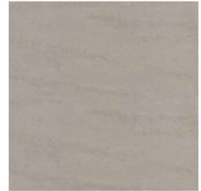
TATRY Graphite SR 1200x1200 mm TATRY Graphit SR 1200x1200 mm