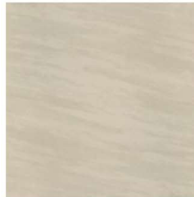
TATRY Pearl SR 1200x1200 mm TATRY Perlmutt SR 1200x1200 mm