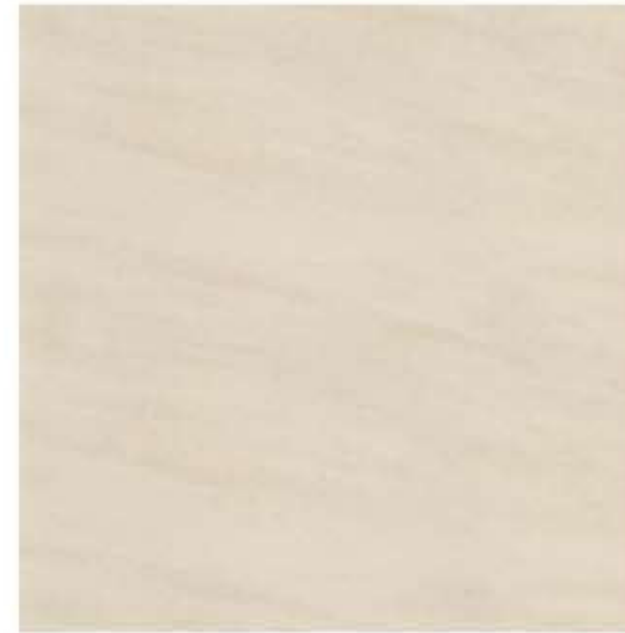
TATRY Beige SR 1200x1200 mm TATRY Beige SR 1200x1200 mm